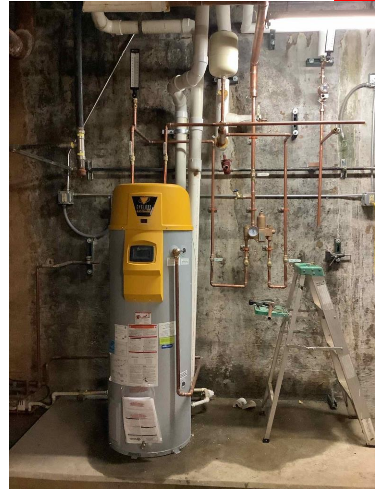
Water heater installation