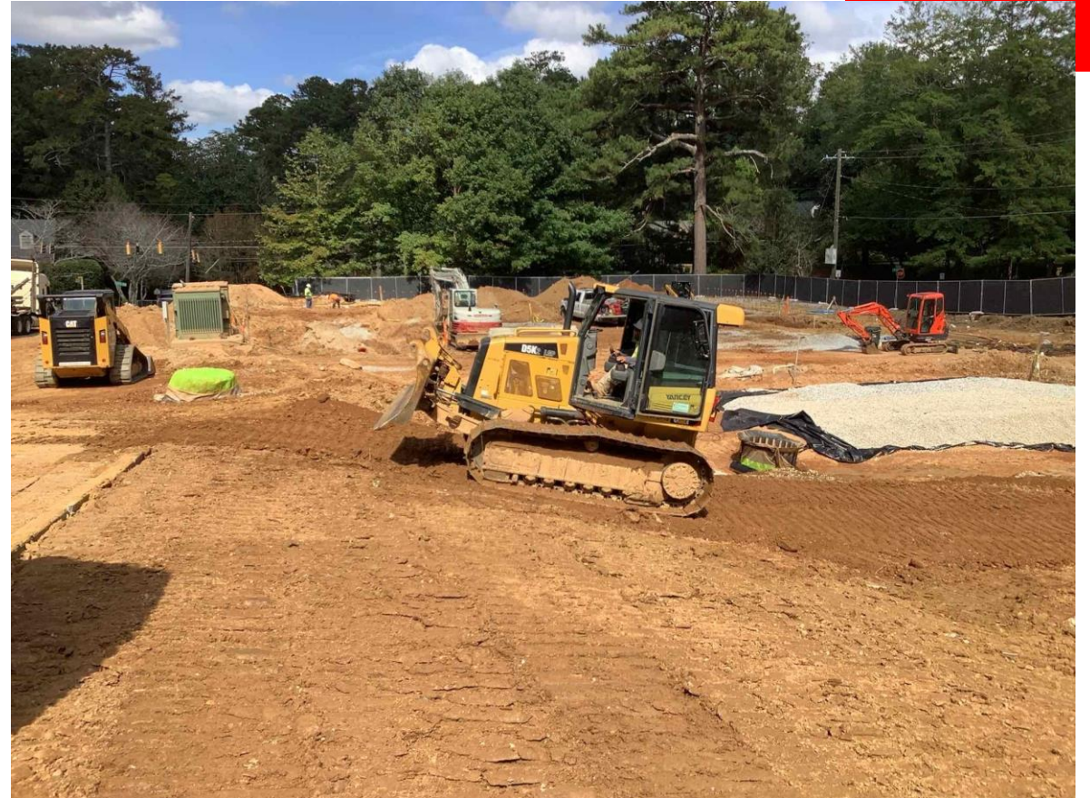
Site grading following retaining wall demolition