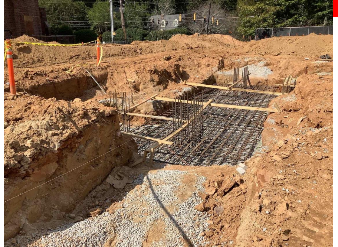
Rebar for new gym footings and elevator shaft